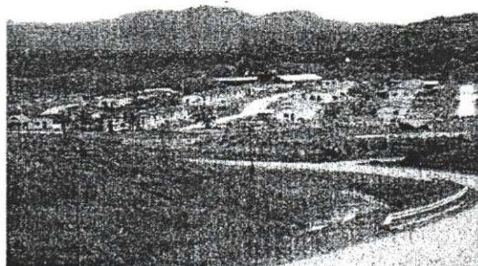
Figure 1. Developing house and infrastructures for participant in Pulau Banggi, Sabah.

allocated for agropolitan schemes almost RM960 million for land development of 16,903 hectares that managed by various government agencies such as FELCRA 4 , KEDA 5 , KESEDAR 5 , RISDA 6 and others. The private sector also involved with efforts to facilitate a farming business, such as sheep, corn, cocoa, herbs and chicken. Local universities also provide human capital while social institutions are involved in community programs such as 'rukun tetangga', etc. Among the areas involved are Pulau Banggi in Sabah, Tanjung Gahai in Pahang, Sik in Kedah, Gua Musang in Kelantan and a few more coming in the pipeline. Direct benefit from the implementation of this agropolitan approach can be seen from the increase of the average income of RM520 to RM1200 per month for each selected participant. By having the complete infrastructure facilities and utilities, the agropolitan population indirectly feels the impact of these changes.